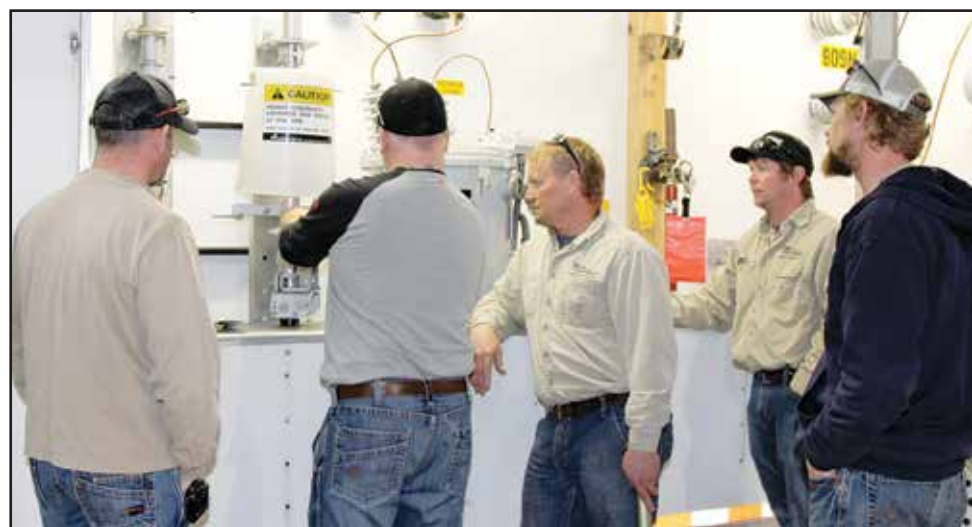
Line crews are trained in safe operation of Great River Energy's transmission line switches.

ads, flyers, social media and our electronic sign to remind the public not to approach downed power lines, climb ladders, use farm equipment or fly kites near power lines, to dig near underground power lines and more.