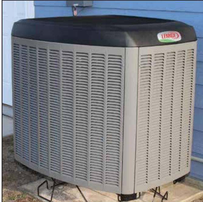
Using an air source heat pump on energy management can cut heating and cooling costs significantly each year.

The iComfort can be programmed to lower the home's temperature during the day when the Andersons aren't there. However, through an app