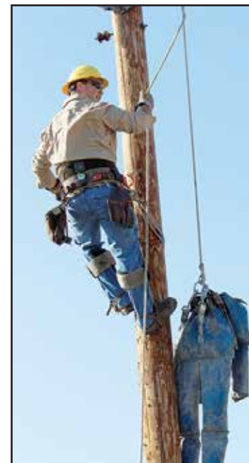
Annual pole top rescue is conducted with line crews.

Provided by MREA and STAR Energy, these newsletters provide additional training on specific aspects of safety as a reminder to