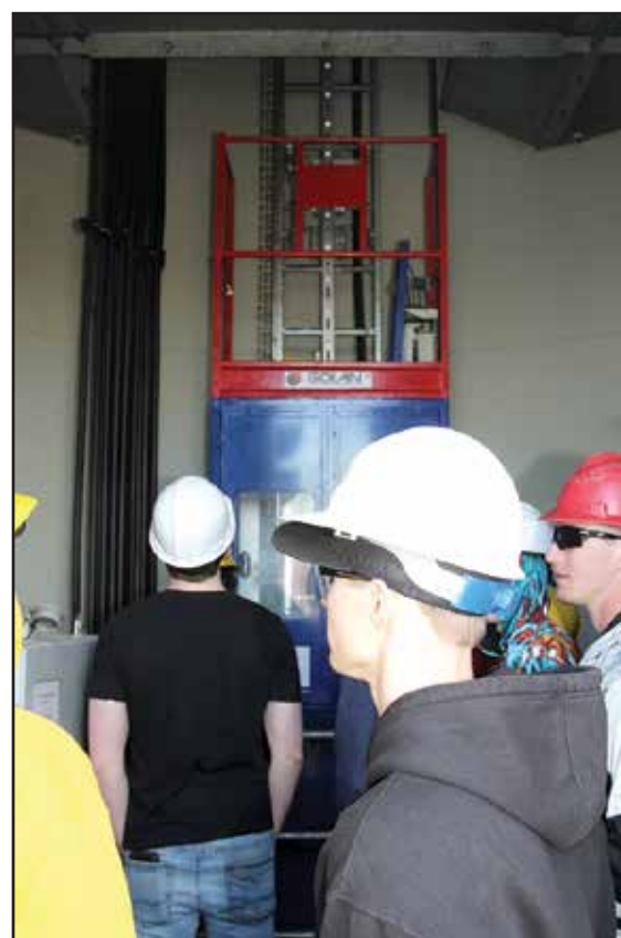
Inside of a wind turbine. This one is the "Cadillac" of turbines, since it has an elevator (in back) that brings workers to the top for repairs.