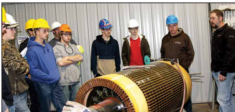
The class toured Litchfield's Integrated Power Systems to see how motors are refurbished for the wind industry and other industries.

Encouraging the next generation of electricians, electrical contractors, linemen and energy technicians is one of the ways Meeker Cooperative gives back to the communities in our service territory.