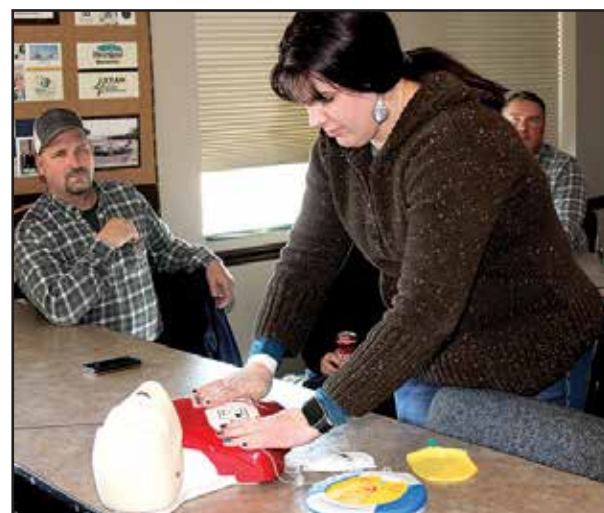
Employees are trained annually in First Aid, CPR and AED use.

At our member events, two of our foremen linemen conduct electric safety education with the help of a live electrical safety trailer. Using live electricity and safety equipment, they are able to demonstrate the effects of contact with electricity, which is a great reminder to members to stay away from electric lines at all times.