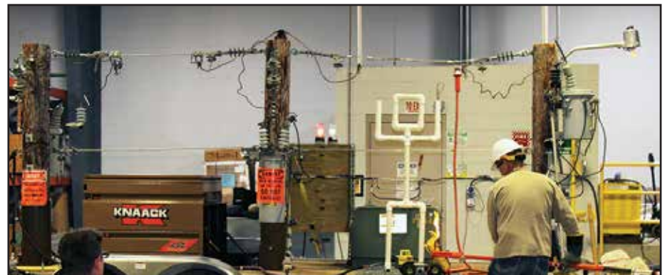
This live electric safety trailer is one way the Co-op educates members and the public about safety.

Although May is National Electric Safety Month, we think about safety all year long. Part of our mission statement is to “provide safe, reliable energy...” How we do that involves an entire culture that is focused on safe work practices, both inside and outside the headquarters building. Although much of the following seems to involve only employees, working safely in-house or in the field is crucial to being able to provide our members with reliable and safe service. If we don’t conduct ourselves in a safe, professional and thorough manner, the power we provide to our members could be compromised. Here are the ways we protect our members, employees and community residents while providing the reliable and safe energy that is so important: