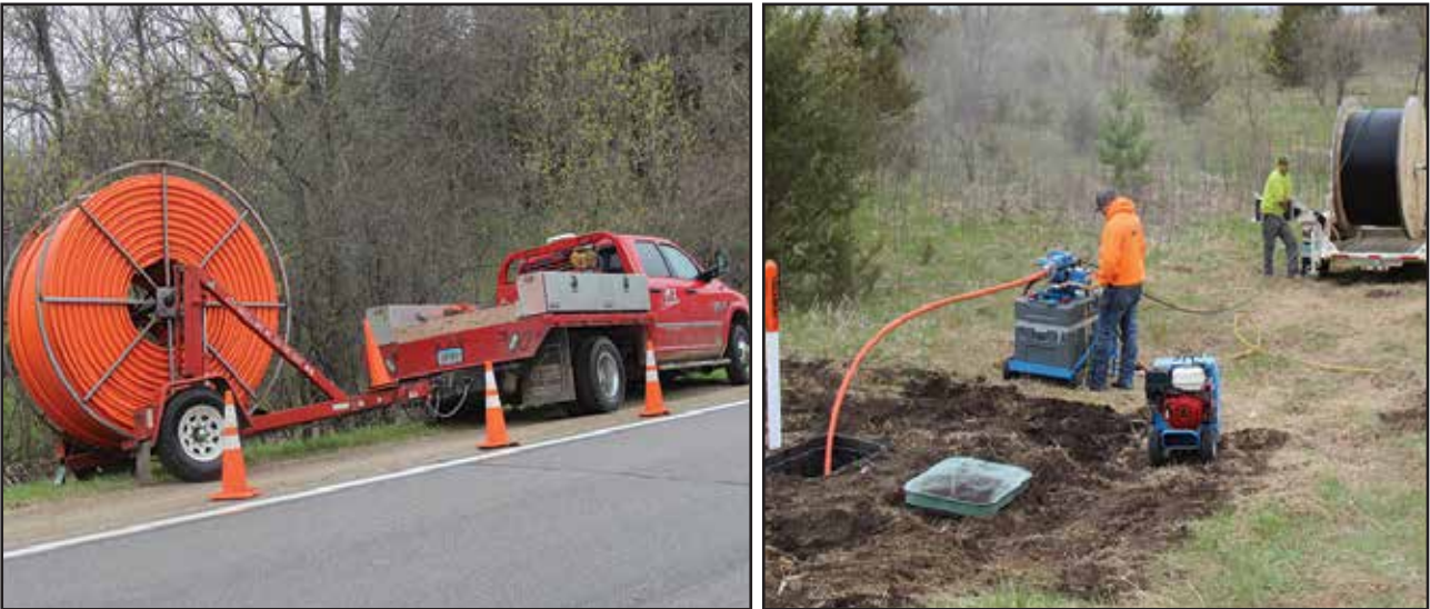
Construction continues north of Dassel near Swan Lake as crews bore holes for the orange conduit to be installed underground (left) and then blow in the black fiber cable through the conduit (right). Other crews will come behind and splice the fiber where necessary. Location #12-29-403

For further updates on the VIBRANT Broadband project, check the Meeker Co-op website at www.meeker.coop , our soon to be released VIBRANT website at www.VIBRANTbb.net , and our Facebook page at www.facebook.com/meeker.coop/ .