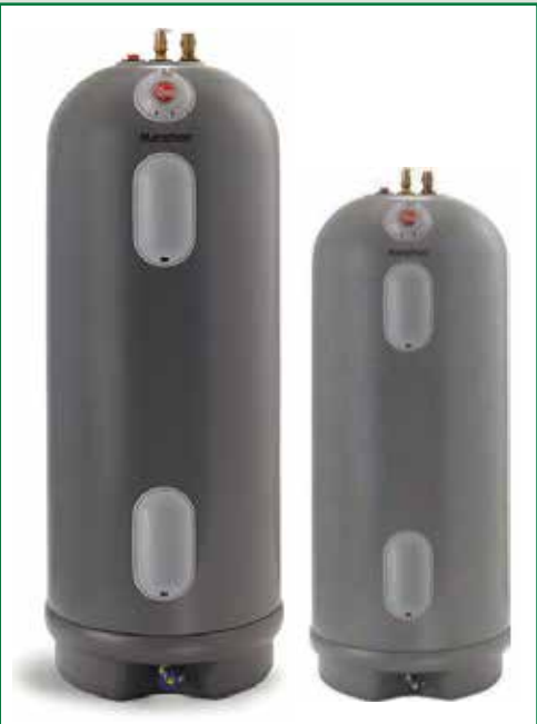
85-gallon and 50-gallon Marathon water heaters to fit your space

Money-saving interruptible water heating is affordable and easy.