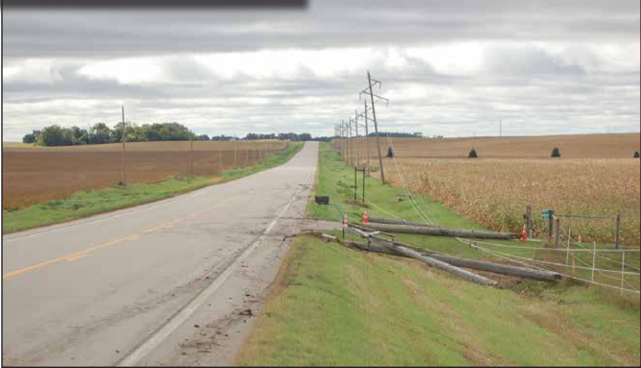
Storms or accidents involving power lines are dangerous. Always assume lines are live, even when on the ground, to avoid electrocution.

If you come upon a car accident involving a utility