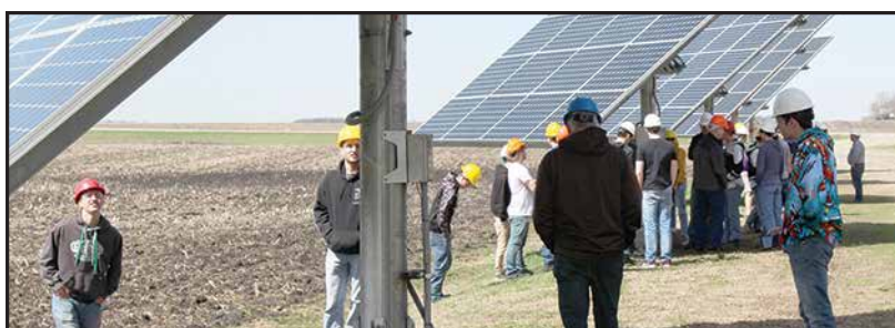
This solar installation has sensors that track the sun as well as motors that turn and tilt the solar panels to catch as much sun as possible throughout the day.

During a sloppy Joe lunch at the Co-op, students heard about Meeker's new VIBRANT Broadband project, our Energy Management programs and how and when energy load control is initiated.