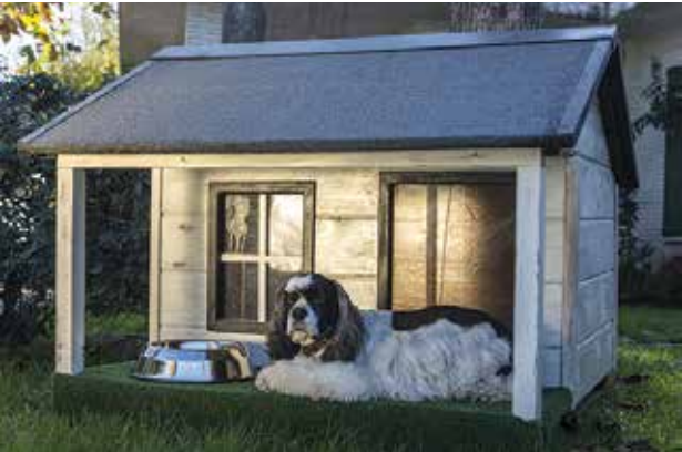
Pet houses can help keep your furry friends comfortable.

A report by the Purdue Center for Animal Science says that Siberian huskies can tolerate temperatures below freezing, but some short-haired dogs require temperatures of 59 F or higher. Older animals may require warmer temperatures than younger ones. During summer, cats and dogs handle the heat in different ways. Cats clearly enjoy warmer temperatures than dogs, and they do a good job of reducing their activity level as temperatures climb. But