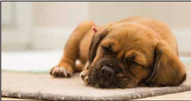
This pup understands the comfort of an insulated bed to sleep on.

We love our pets, and we love saving energy! Often, what we do for our pets wastes unnecessary energy. Here are three common ways to save energy while caring for our pets: