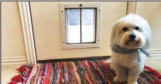
Consider installing a pet door that is certified by the Alliance to Save Energy (ASE) or has a double or triple flap. These types of pet doors can reduce energy loss and make life easier for you and your pets.

that house cats and dogs, requires these facilities to maintain temperatures above 50 F. Some exceptions are allowed for breeds accustomed to the cold or if some form of insulation for the animals is provided. Your pet's tolerance really depends on their breed and the thickness of their coat.