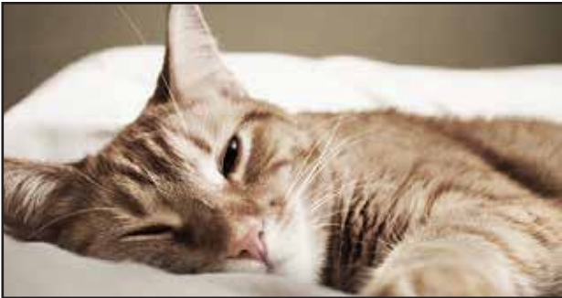
Cats love blankets too!

Cats and dogs can handle the cold better than humans. The U.S. Department of Agriculture (USDA), which regulates facilities