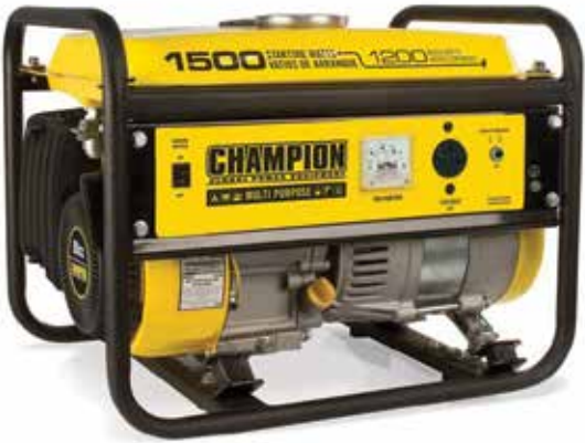
Portable generators are helpful during an extended power outage, but they can be extremely dangerous if not used properly.