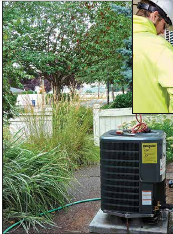
An air-source heat pump compressor located outside the house can distribute hot and cold air through your existing duct system.

Heat pumps are typically much more efficient than electric resistance systems and can be a solid solution in a wide variety of circumstances. They can be the right choice in a manufactured