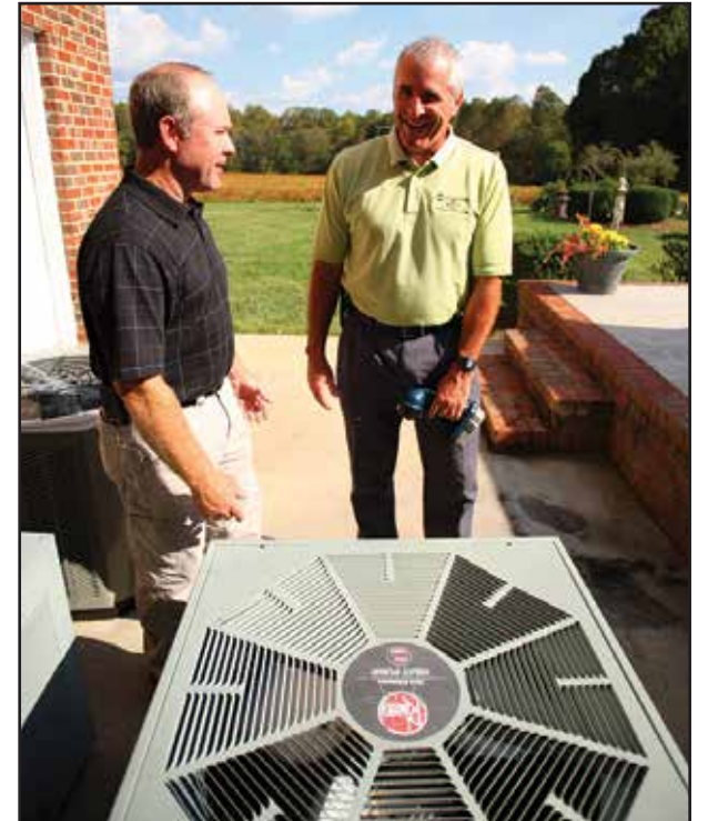
Your electric co-op may be able to provide energy auditors to help determine if a heat pump is a good solution for your home.

2 Want heating and cooling flexibility? A ductless mini-split heat pump can serve up to 4 individual zones or rooms, and each room's temperature can be controlled separately.