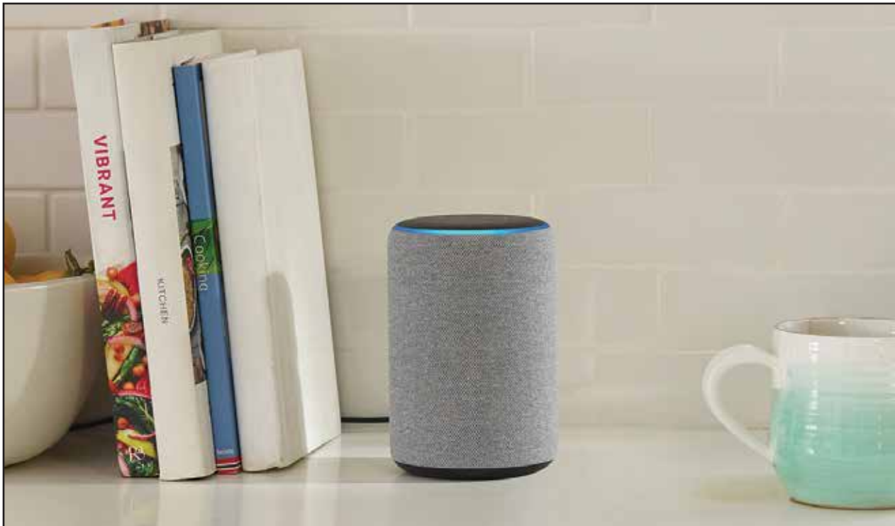
The Amazon Echo Plus is one of the most popular smart speakers available on the market today.