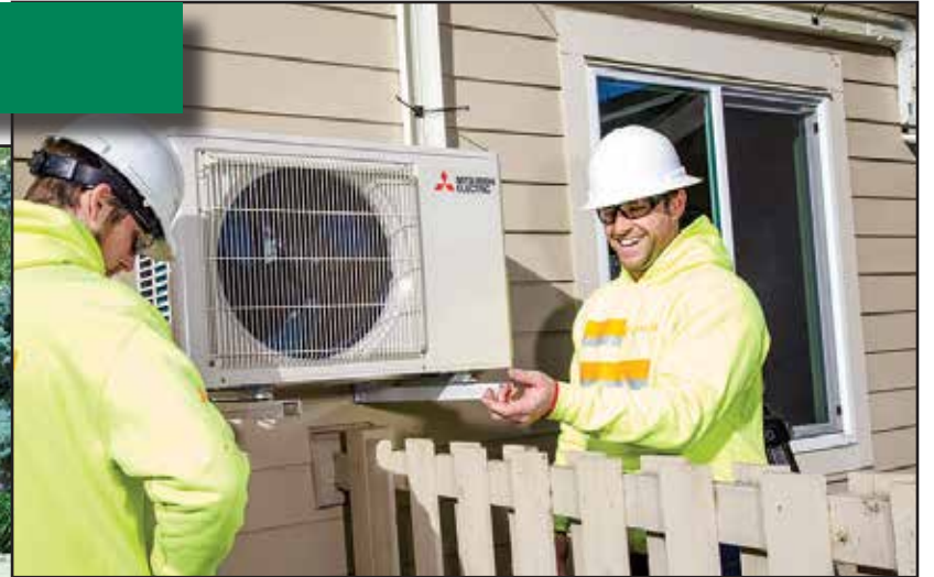
Heat pumps are efficient options in most climates, even for new construction.

1 Want to save money? If you are currently heating your home with electric resistance or propane or heating oil, and you seal air leaks and install additional insulation, installing an efficient heat pump could reduce your heating costs by up to 75%. And if you are currently cooling your home with an old A/C system or window A/C units, you could also cut your cooling costs.