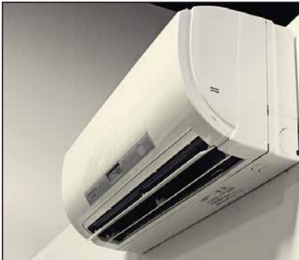
A mini-split ductless heat pump can serve up to four rooms through fans installed in each room.

Dear Anke: The short answer is yes. The two most common types of heat pumps, which you've just described, are often good options. It sounds like your cousin replaced her electric baseboard heaters with a ductless mini-split heat pump. The mini-split system has a compressor outside that is connected with refrigerant lines to the blowers inside. A ductless system can serve up to four zones, so it can heat a small home or can be used in combination with another heating system in a larger home. The ductless mini-split system is a great option for a home that does not have a duct system, or if the existing duct system is inefficient or poorly designed.