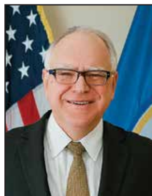
Governor Tim Walz