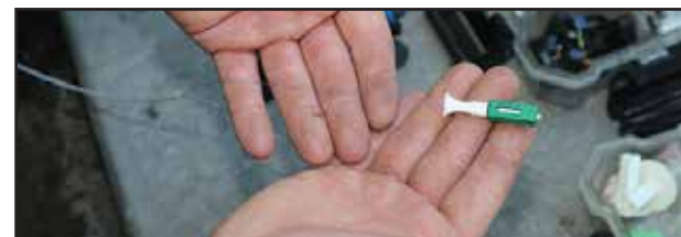
This device protects the splice inside the NID.