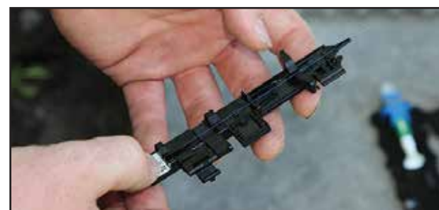
A small, simple mechanical splicing apparatus is used to connect the fibers outside to inside. Rather than fusing the strands together, this device surrounds the splice with a mechanical device that maintains the structural integrity of the splice and allows light to pass through unimpeded.