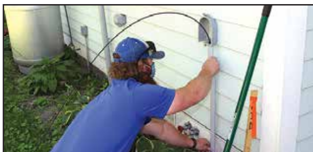
Fiber is dug underground from the ditch, where it was separated and spliced from the main fiber optic cable and trenched to the house, where it comes up through a conduit into the NID.

Follow the pictorial guide to bringing fiber into the home.