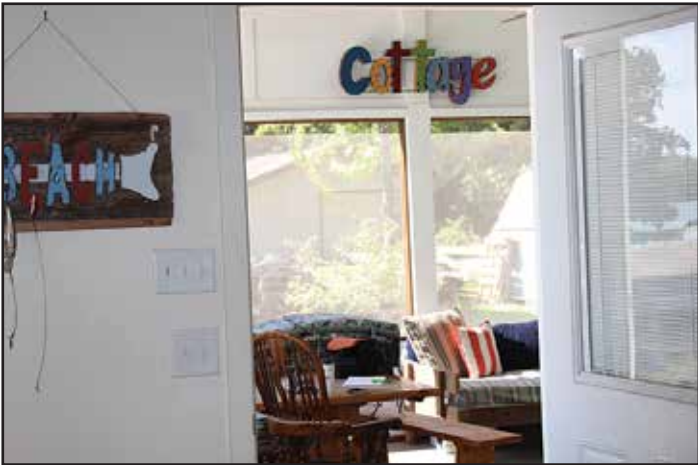
A four-season porch now has a mounted flat-screen TV thanks to VIBRANT.

“I called after they began construction in our area,” Michael said. “We watched them dig the main fiber optic cable in the ditch along our road.”