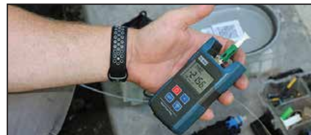
This meter checks to make sure the splice is good and the right amount of data is being conducted. Once the outside looks good, the technician continues to make connections to the router inside the home, checks that everything is working as it should, and answers any questions the homeowner has.