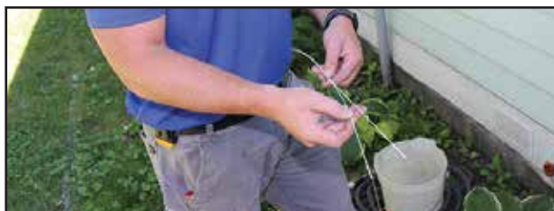
Fiber optic lines are separated and the buffering tubes must be cut away to expose the individual fiber strands that will get spliced to continue into the home. Location # 28-04-3020