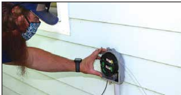
The NID (Network Interface Device) is what makes the transition of fiber optic lines into the home and connects to the router to run the home's devices via WiFi signal.