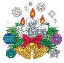
Brenna B, 9 Litchfield