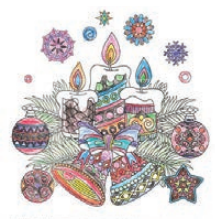
Ella N, 5 Litchfield