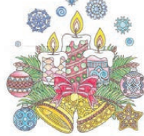
Lyla M, 10 Paynesville