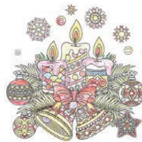
Gannon H, 6 Paynesville