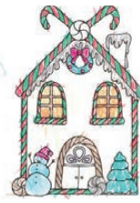
Abby B, 3 Corcoran