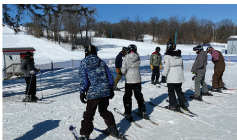
Skiing lessons at Powder Ridge

along with a tour of the building. Later in the morning, the Co-op treated our guests with a fun day on the slopes of Powder Ridge.