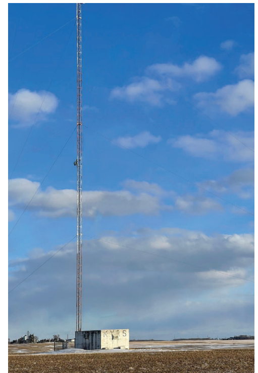
6,000-watt KKLN radio tower powered by Meeker Cooperative.