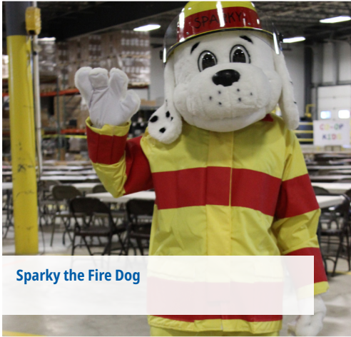
Sparky the Fire Dog

citizens, funding fire departments, and enhancing environmental conservation efforts. The impact has been profound, facilitating social networking opportunities, community celebrations, and education programs that bring people together.