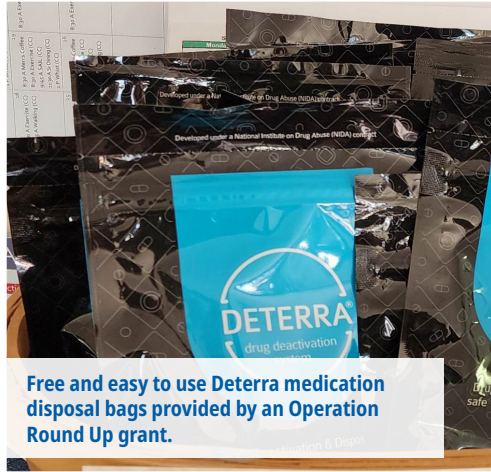
Free and easy to use Deterra medication disposal bags provided by an Operation Round Up grant.

The Meeker Cooperative Electric Trust Board selects grant recipients through a thorough process. Non-profit organizations submit applications, which are researched by assigned Trustees. During Trust Board meetings, applications are discussed and funding decisions are made based on available funds and Trust guidelines. The selection process prioritizes new funding requests and focuses on dispersing contributions to multiple organizations in the Cooperative's service territory. Major